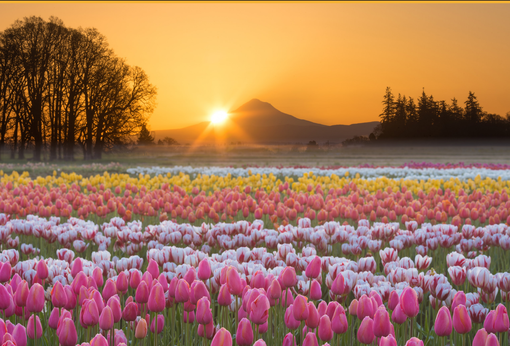
Wooden Shoe Tulip Festival - Woodburn, OR